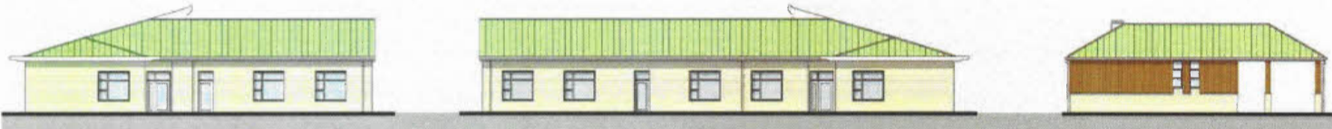
4 N&S Wings/East Elevation (elevations viewed square)