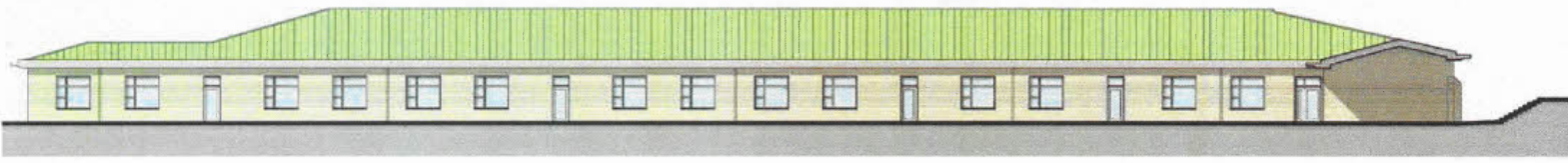
1 North Wing/North Elevation