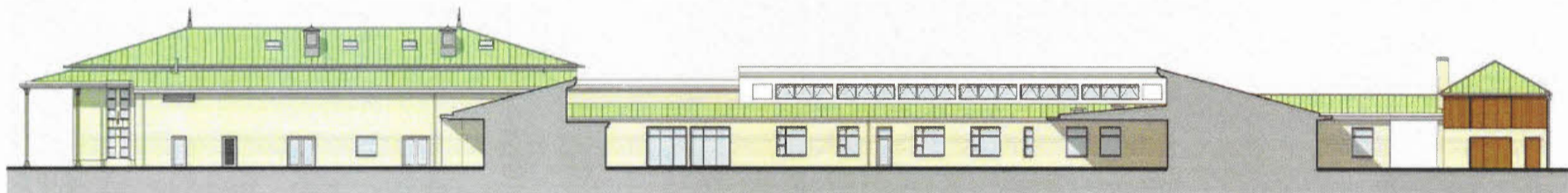
5 West Wing/East Elevation (elevations viewed square)