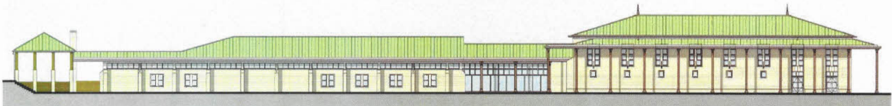
6 West Wing/West Elevation (elevations viewed square)