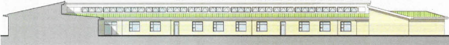
2 North Wing/South Elevation