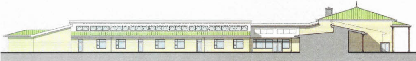
3 South Wing/North Elevation